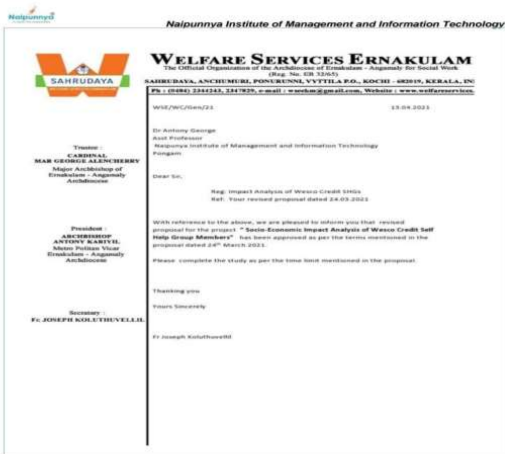
1 Funded project Acceptance letter – Wesco Credit